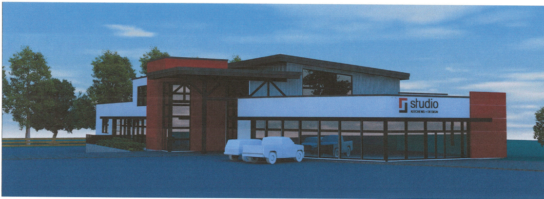
perspective -approaching building